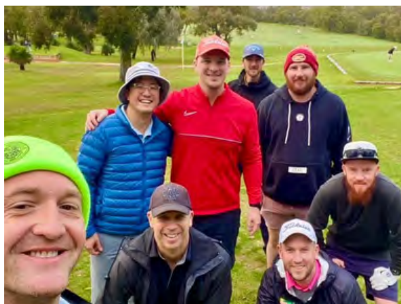
Dads in the Rough members benefitted from WAGF-funded beginners lessons in 2023