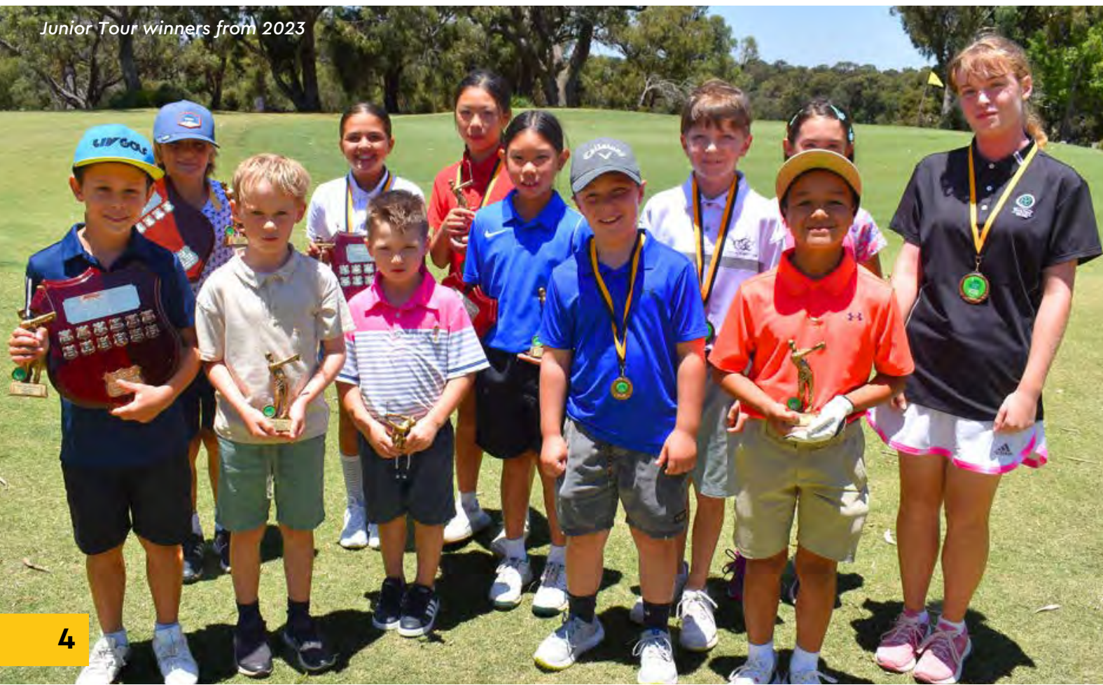
Junior Tour winners from 2023