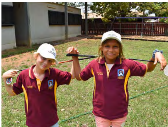
Students enjoying a six-week golf program at Kalumburu Remote Community School

The Trustees again extend their appreciation to all those Clubs and individual members who participated in the Will You Chip In program as well as donating in other forms to make the work of the Foundation possible. ■