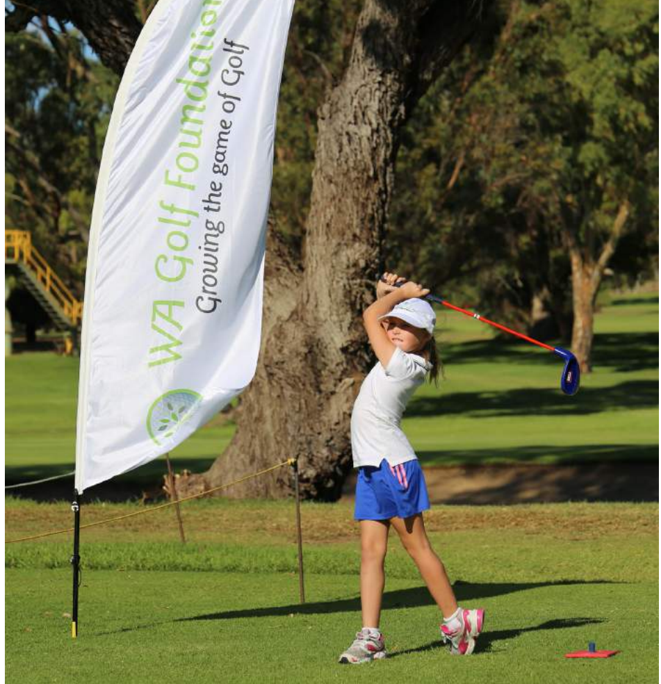
The First Tee Program at Kwinana Golf Club