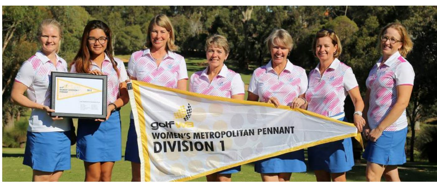
Lake Karrinyup Country Club - 2015 Women's Pennant Champions

Members of the GMC are allocated a portfolio depending on their skillset, experience and expertise. The areas of responsibility for the GMC include Handicapping & Course Rating, High Performance, Rules & Amateur Status, Events & Tournaments and Game Development.