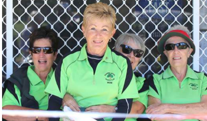
Participants from Drummond Golf Country Week, the Aglime State Sand Green Championship and the Regional Seniors