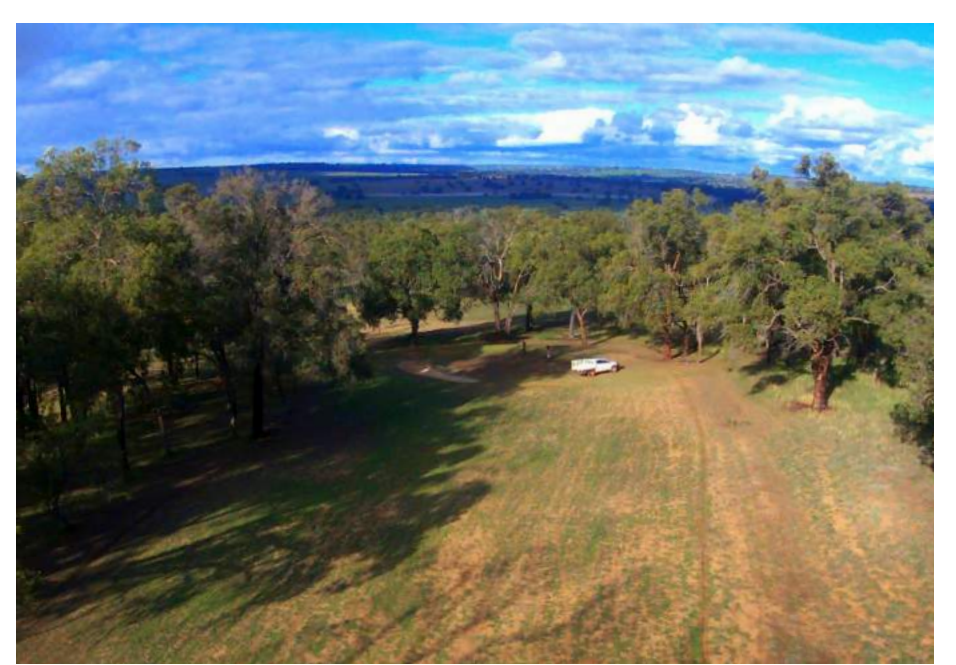
Dandaragan Golf Club

During GolfWA's Strategic Plan review in 2014, and in conjunction with the excellent work being done by Golf Australia to build a Club Support Portal, the Board considered the general "health" of our member Clubs and Districts. We were aware of significant data from within Australia and abroad that was indicating clear negative trends for Golf in general and were keen to assess how this translated to our own members. As a consequence, our revised Strategic Plan acknowledged Club Health as a key issue for the Board's attention, becoming one of our 4 Critical Drivers, and it was resolved that the guiding objective of the Club Health initiative would be "To maintain a network of thriving and sustainable Clubs by supporting their planning for a sustainable future".